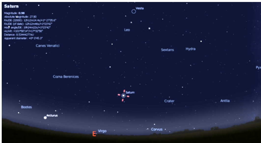
Saturn at 21h30 in the beginning of March (07/03). This image was made using Stellarium .

Saturn will be visible above the Virgo and Corvus constellations as the brightest object of the East side of the sky.