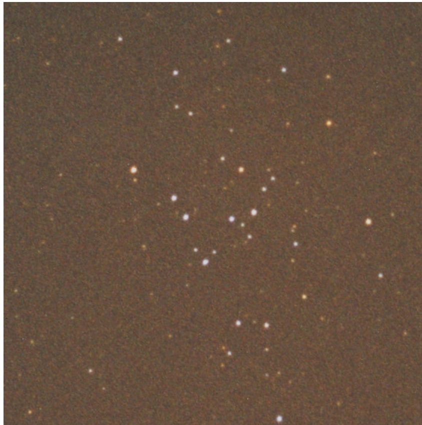
Melotte 111, taken from a rural location in England in March 2003.

The Coma star cluster used to be known to represent Leo's tufted tail, but Ptolemy III, in around 240 BC, renamed it for the Egyptian queen Berenice's sacrifice of her hair in a legend.