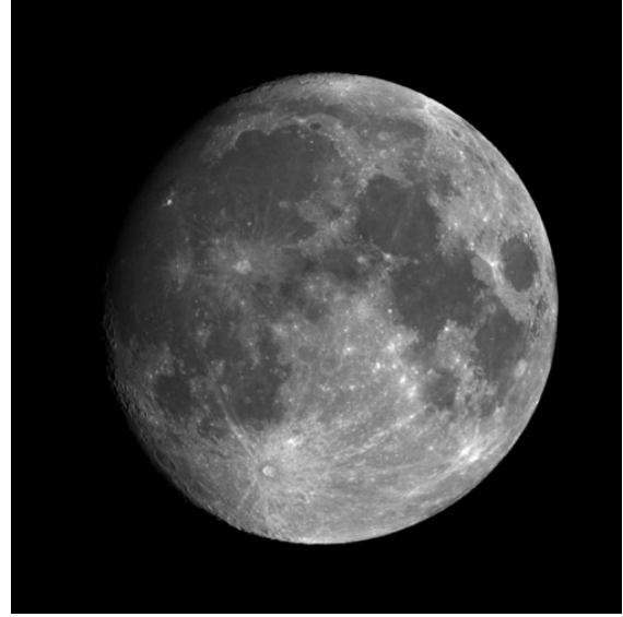
Fig. 1. The Moon